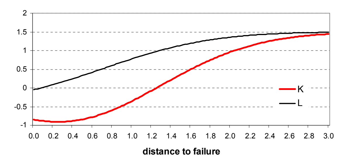
<u>Note:</u> The graph shows the dependence of K and L on T for the risk aversion parameter \gamma=1.5 and wealth standard deviation \sigma=0.5 .

Obviously, we are only interested in the results in the regular region of T-values, where the shareholder prefers higher mean wealth to lower and is genuinely risk-averse. Therefore, "not too close to failure" will mean the requirement of positive K and L. In the example shown in Fig.1 this would mean distance to failure above the level of 1.3.