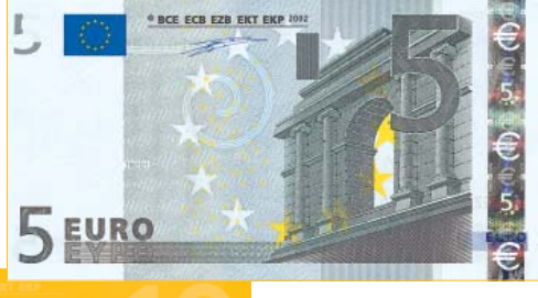
In 2006 all ECB publications feature a motif taken from the €5 banknote.

by Jorge García-Andrade and Phoebus Athanassiou