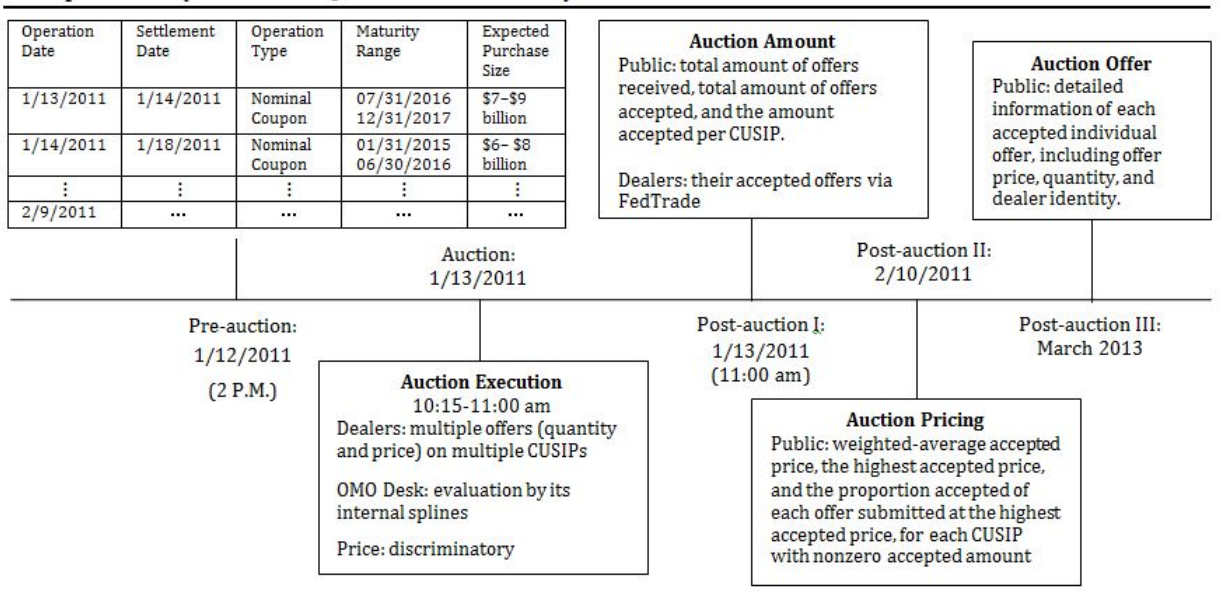
Example: Monthly Timeline of QE Auctions of Treasury Securities

sury purchase operations, including operation dates, settlement dates, security types to be purchased (nominal coupons or TIPS), the maturity date range of eligible issues, and an expected range for the size of each operation. Therefore, the announcement identified the set of eligible bonds to be included as well as the minimum and maximum total par amount (across all bonds) to be purchased in each planned auction. While the purchase amount has to reach the minimum expected size, the Fed reserves the option to purchase less than the maximum expected size.