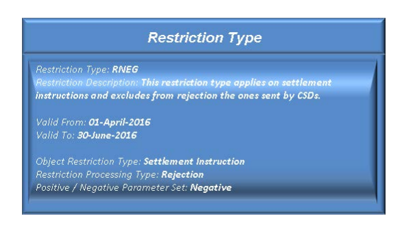
Example 2 - Creation of a new negative restriction type (C)

In addition, the CSD implemented a rule for this Restriction Type including only one parameter configuration: Party Type = "CSD" as shown in the example below.