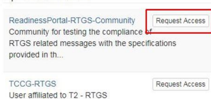
Figure 1: Request Access to ReadinessPortal-RTGS-Community