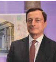
Mario Draghi President, European Central Bank

Since their introduction in 2002, euro banknotes have become one of the world’s most trusted means of payment. To maintain that trust, the Europa series incorporates the latest banknote technology.